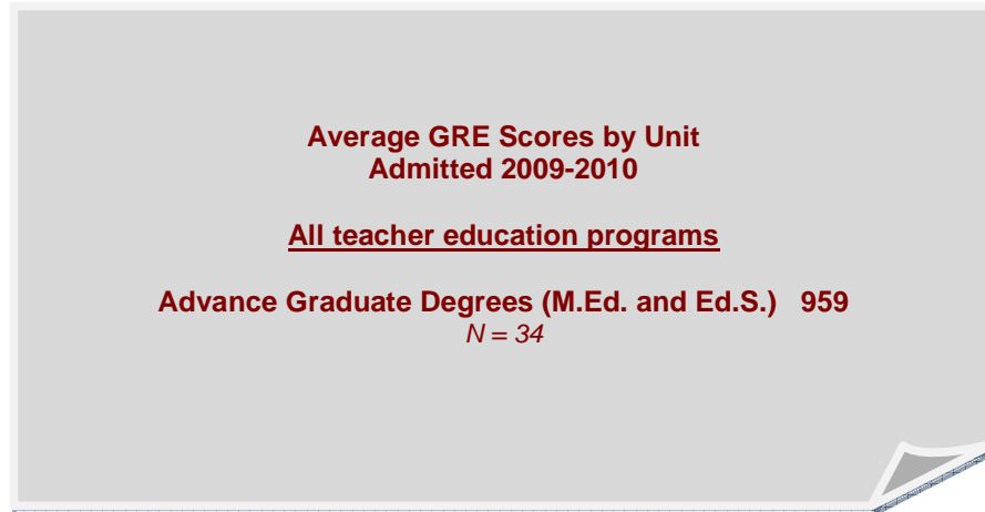
Average GRE Scores by Unit Figure 11

• • • Educator Preparation Programs Assessment –Advance Degree Transition Points Gate 5: Entry to Advance Degree Program –Undergraduate GPA and GRE Scores • • •