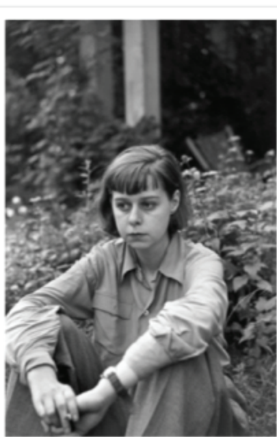
Carson McCullers A young McCullers.

The conference will offer new perspectives on McCullers's life and work, especially on such topics as the international appeal of her work and its significance in global contexts, and its resonance and relevance in the twenty-first century.