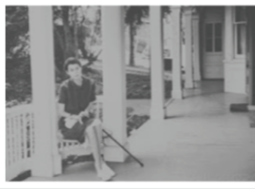
Carson McCullers McCullers on the porch of her home in Nyack.